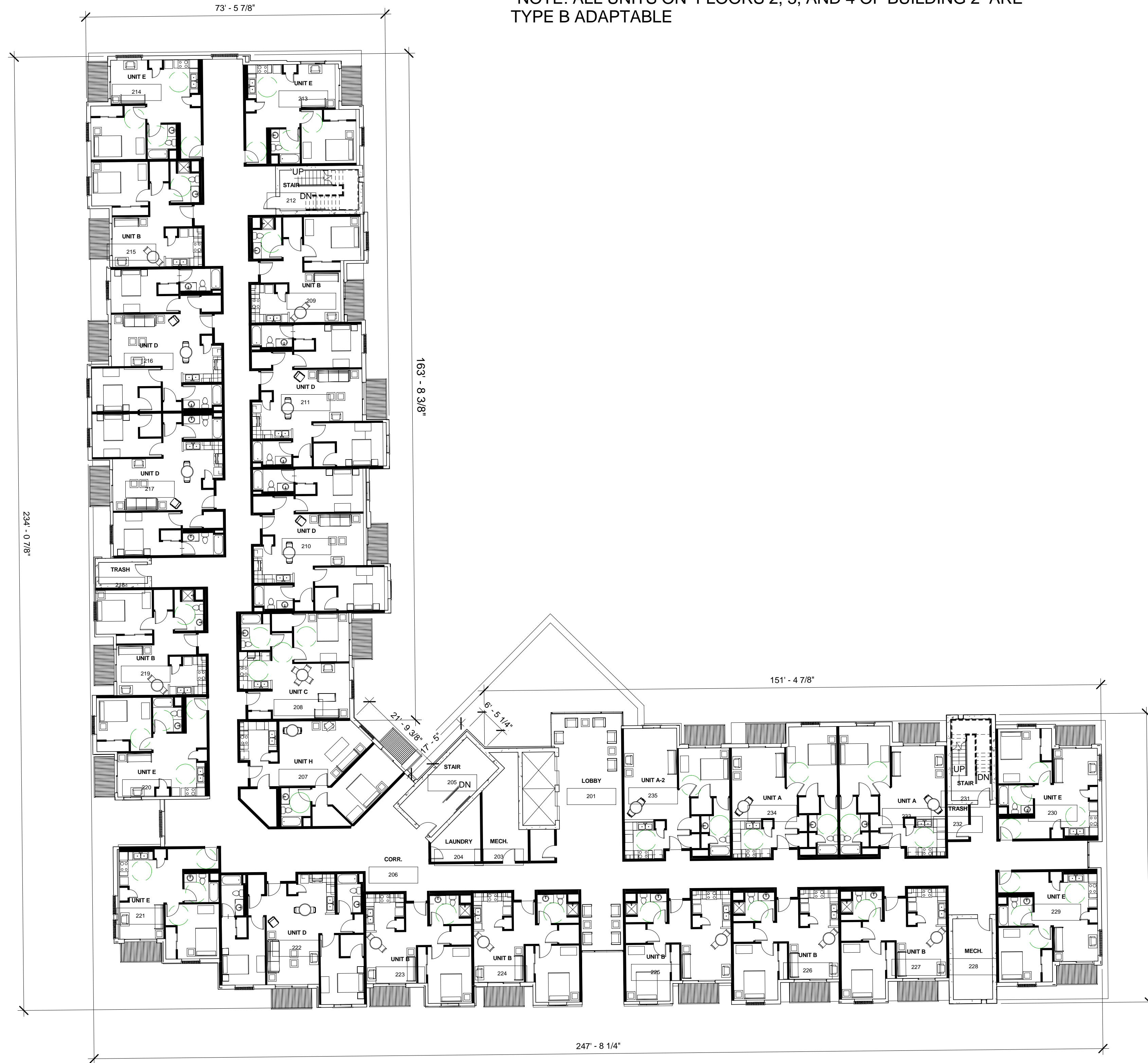
1 BUILDING 2 - LEVEL 2 1/16" = 1'-0"

*NOTE: ALL UNITS ON FLOORS 2, 3, AND 4 OF BUILDING 2 ARE TYPE B ADAPTABLE