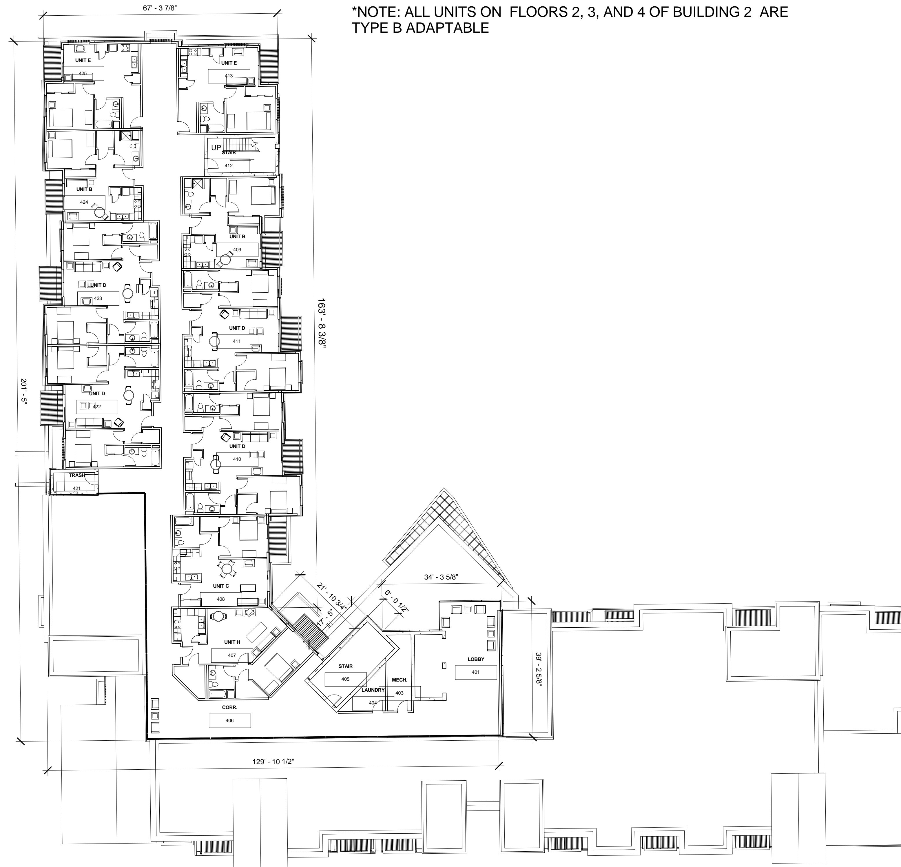
1 BUILDING 2 - LEVEL 4 1/16" = 1'-0"

*NOTE: ALL UNITS ON FLOORS 2, 3, AND 4 OF BUILDING 2 ARE TYPE B ADAPTABLE